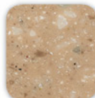
Honeysuckle | G504R