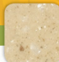
Lemongrass | G503R