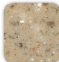
Jasmine | G505R