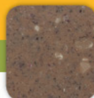
Cocoa | G501R