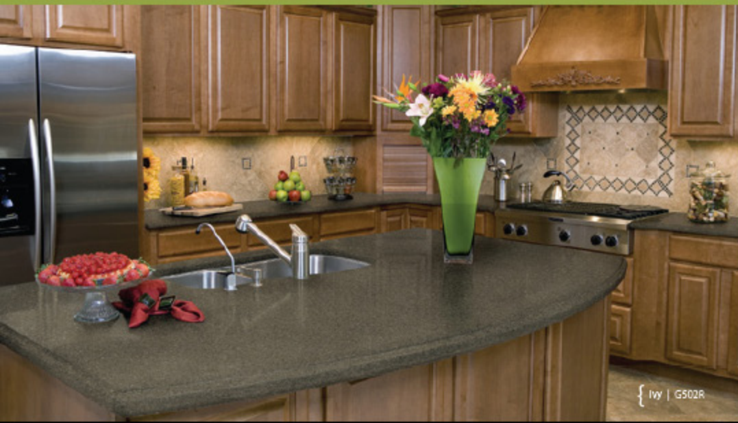
{ Ivy | G502R

The LG EDEN COLLECTION was inspired by the pleasing aroma and organic beauty of different botanicals. From warm olive tones to rich creamy beige, all of the colors were meticulously designed to evoke the senses and represent the magnificence of the earth's natural palette.